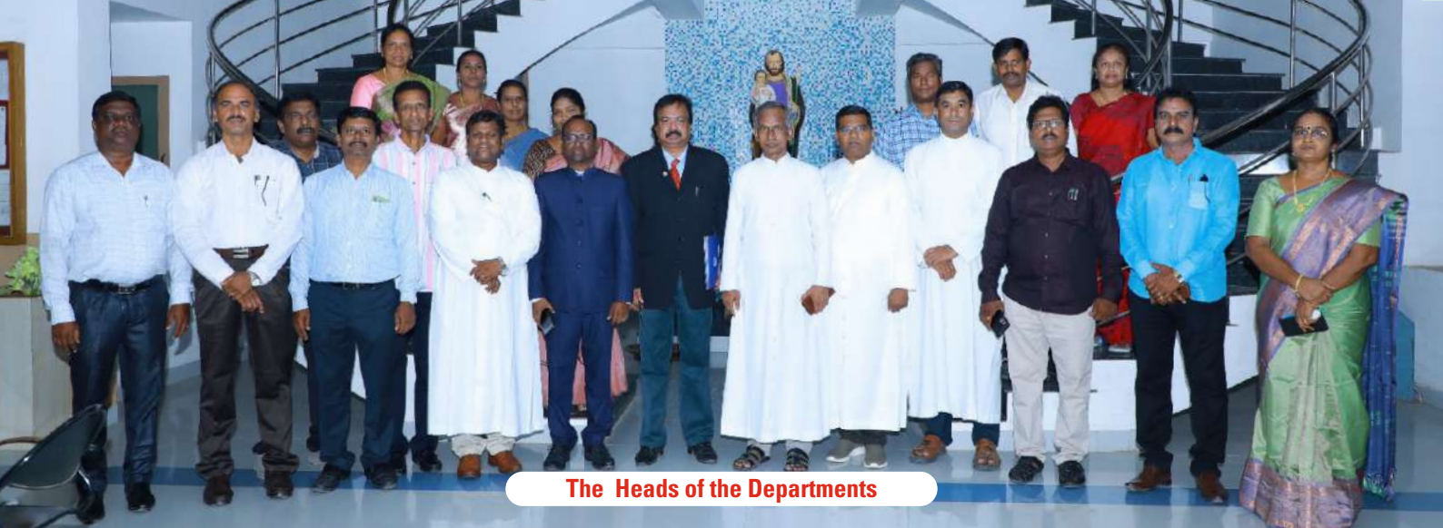
The Heads of the Departments