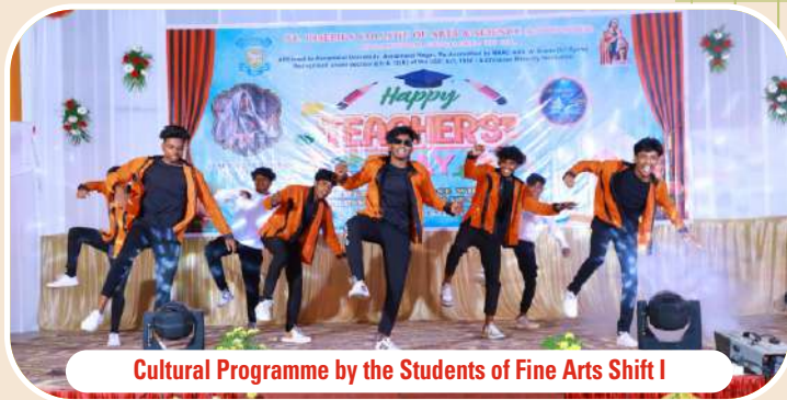
Cultural Programme by the Students of Fine Arts Shift I