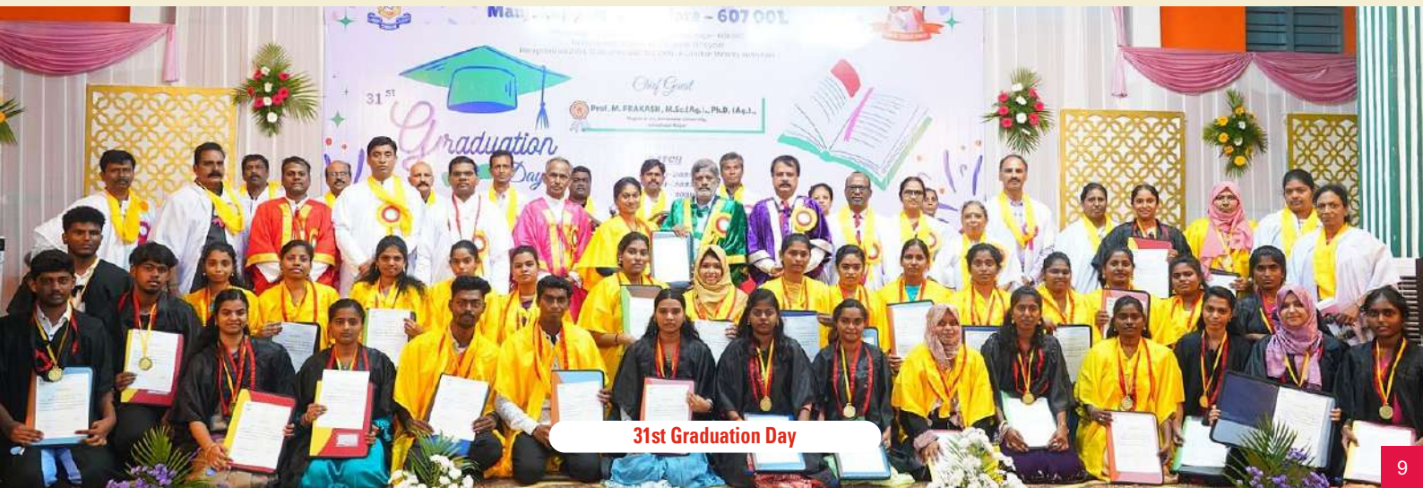
31st Graduation Day