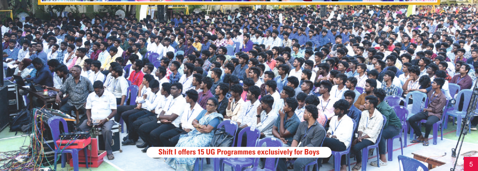
Shift I offers 15 UG Programmes exclusively for Boys