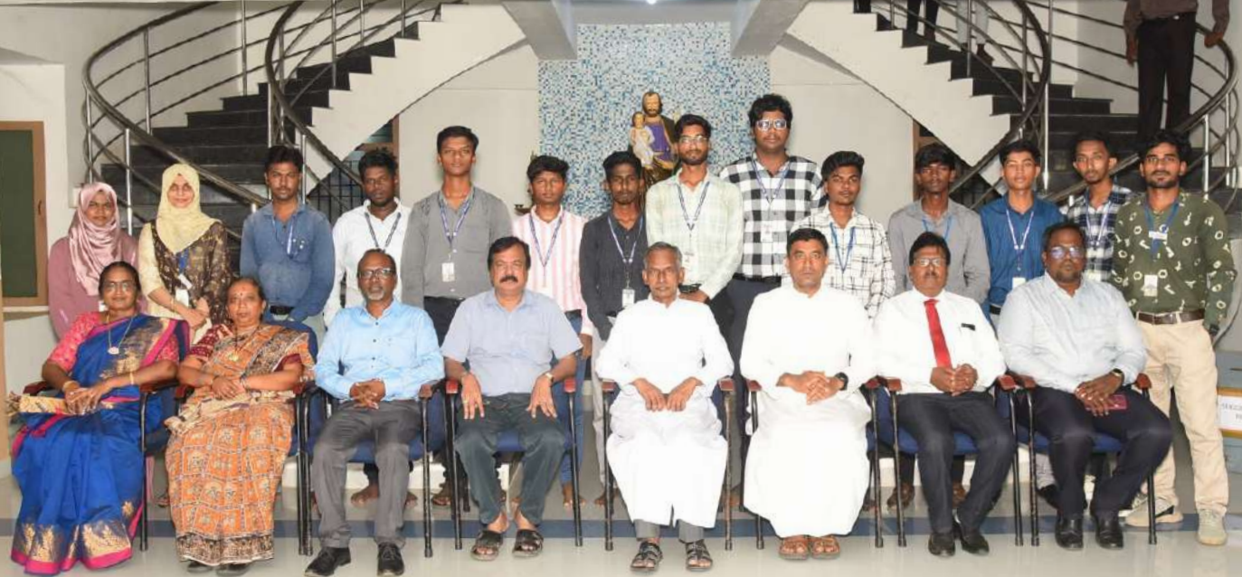
Final Year Students who received offer Letters from TCS, Chennai