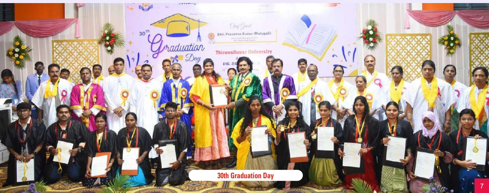
30th Graduation Day

St. Joseph's has a reputation of being one of the best disciplined colleges in Tamil Nadu. While being an eminently 'learning place' to study in, our students observe the code of good conduct quite happily and readily. The Disciplinary Committee is empowered to deal with cases of indiscipline. The Secretary (or) Principal of the College is the ultimate authority to take action against any breach of discipline.