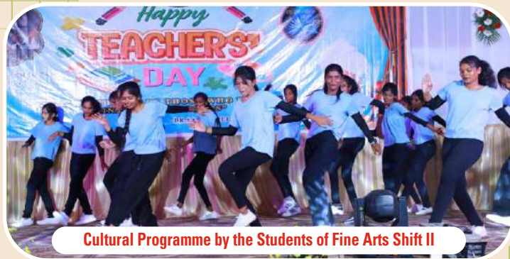
Cultural Programme by the Students of Fine Arts Shift II