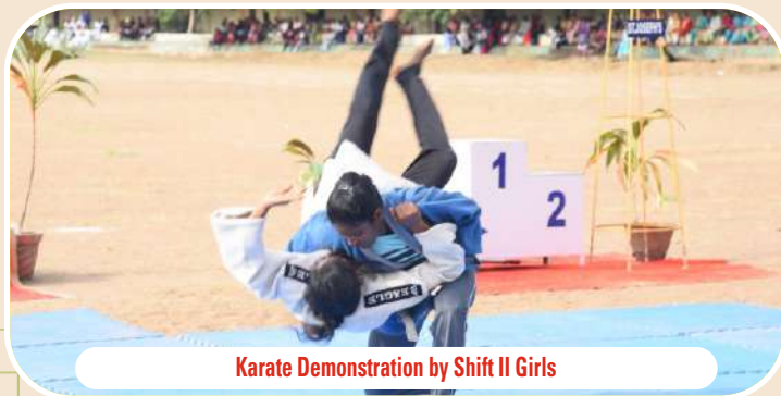
Karate Demonstration by Shift II Girls