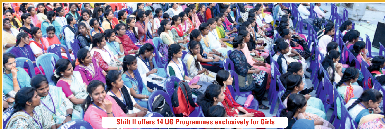
Shift II offers 14 UG Programmes exclusively for Girls

We insist high standards of behavioural values to foster a sense of responsibility and self-discipline in our students. We instil the key values of human bignity, solidarity, peace and respect, which are constant themes of assemblies and our Spiritual, Moral, Social and Cultural development programmes.